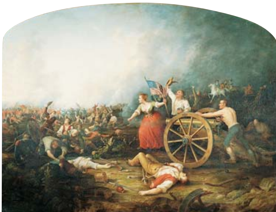
▲ Molly Pitcher was the heroine of the battle of Monmouth, New Jersey, in 1778.

including Philadelphia's Quakers and Jews. Due to the efforts of Morris and Salomon, on September 8, 1781, the troops were finally paid in specie, or gold coin.