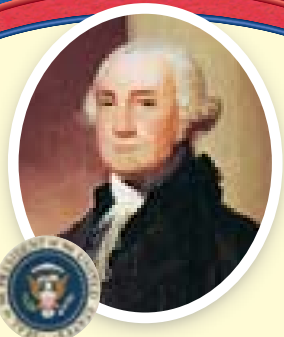
GEORGE WASHINGTON 1732–1799

During the Revolutionary War, Commander in Chief George Washington became a national hero. An imposing man, Washington stood six feet two inches tall. He was broad-shouldered, calm, and dignified, and he was an expert horseman. But it was Washington's character that won hearts and, ultimately, the war.