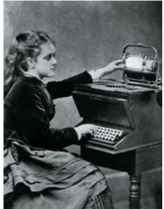
▲ The typewriter shown here dates from around 1890.

Industrialization freed some factory workers from backbreaking labor and helped improve workers' standard of living. By 1890, the average workweek had been reduced by about ten hours. However, many laborers felt that the mechanization of so many tasks reduced human workers' worth. As consumers, though, workers regained some of their lost power in the marketplace. The country's expanding urban population provided a vast potential market for the new inventions and products of the late 1800s.