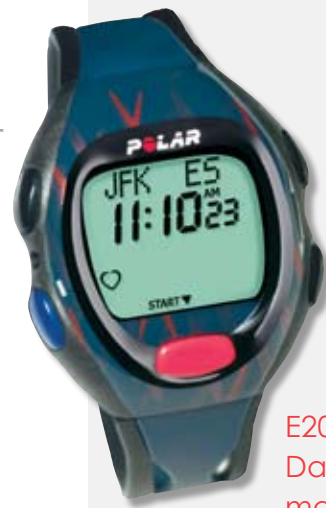
E200: Data collection made simple