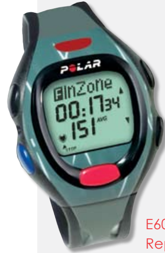
E600: Reports at the touch of a button